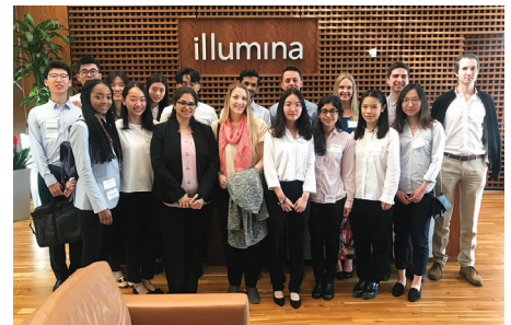
MBP students visited Illumina during their spring 2019 industry site visit trip.