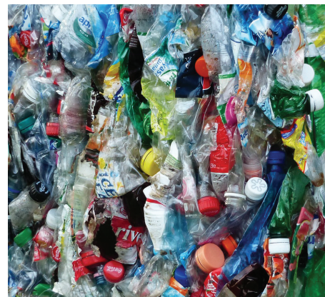
The new Program on Plastics, Ecosystems, and Public Health will bring together experts from across Northwestern to gain a scientific understanding of the impacts of plastics use and accumulation worldwide.